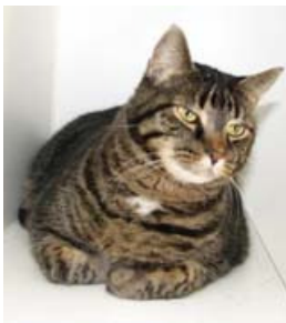
#2071 Blue-Declawed (Tabby – Brown)

"Hi. I'm Blue and I'm a big fat cat who came here back in mid-September. I'm about five years old and I love to lounge around and be lazy. I'm housebroken, good with kids, and declawed in the front so I won't tear up your furniture. Come on out and see me!"