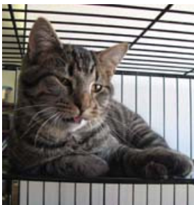
#2064 Jesse-Sponsored (Domestic Short Hair-mitted)

"Hi. I'm Jesse and I'm a cool cat who just arrived at the shelter a few days ago. I'm about twelve weeks old and I'm at a great age to be a fun little friend for someone who needs a pal. Please come out and meet me and see if you'd like to take me home." Thank you to an anonymous donor, who sponsored a portion of Jesse's adoption fee. Now he can go home at a reduced rate!