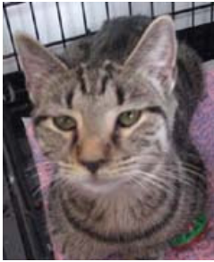
#2015 Nibbles-Sponsored (Tabby – Grey)