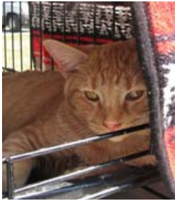
#2064 Joey-Sponsored (Domestic Short Hair-orange)