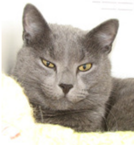
#2092 Grady (Russian Blue, Manx Mixed )

"Hello. My name is Grady and I'm a sweet kitty who owner had to turn him in. The neighbor didn't like me and said he was going to get rid of me. I don't know what he was planning on doing to me, and they didn't either, so they thought it best if I come out here where I'd be safe. I'm only about a year old and I'm housebroken. Just waiting for a new home." December Adoption Fee: $50