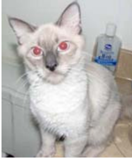
#256 Angel (Siamese)

"Hello. My name is Angel and I'm one of five cats whose owner brought us here and turned us in. He said he just simply had too many cats and needed to downsize. So unfortunately, we had to come out here to stay til they can find new homes for us. I hope it doesn't take long cause this place is getting full pretty fast." December Adoption Fee: $50