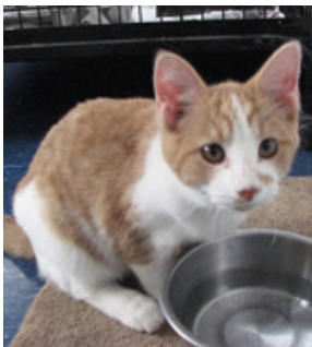
#213 Tommy (Domestic Short Hair - orange and white)

"Hi. I'm Tommy and I'm one of four kittens that were part of a big litter. Somebody found us down on Waddy Road. Our owner probably dumped us there. That's what people do when they don't want their pets anymore. We're only about seven weeks old and we're looking forward to going home." December Adoption Fee: $50