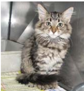
#260 Becca (Tabby - Grey)

"Hello. My name is Becca and I'm a little tabby kitty out at the shelter waiting for my new family to come get me. Well, actually there are lots of us here. But I'm really hoping I'm the one you'll like, so that you can adopt me and let me go home with you. I'm sure you'll love me if you meet me." December Adoption Fee: $50