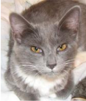
#282 Anastasia-Fostered (Domestic Short Hair - gray and white)

“Gosh, I just don't know where in the world all these cats are coming from! There are so many here, and they just keep bringing them in. I sure hope I'm one of the lucky ones who get adopted cause I'm really sweet and I want a family of my own so very badly.”