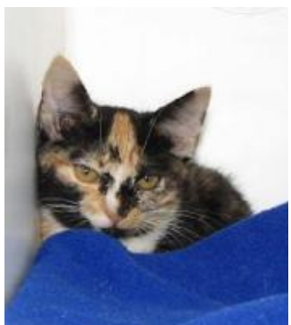
#2067 Morgan (Tortoiseshell)

“Hi. My name is Morgan and I came here with my two siblings, Carter and Reggie. Somebody found us over on Sunrise Lane, but they didn't know who we belonged to, so they brought us out here to stay til we get adopted. Hopefully somebody will come get us and take us home.”