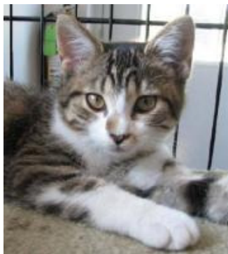
#2025 Tyler (Domestic Short Hair-mitted)

“Hello. My name is Tyler and I came here to the shelter with my brother Sam. We're sharing a kennel with two other kittens right now though. We all like each other and have lots of fun, but I'm pretty tired right now and I think I'll just lay down and take a nap, if this will quit taking pictures of me, that is.”