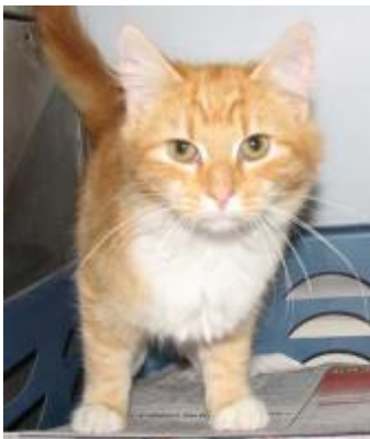
#299 Ziggy (Domestic Medium Hair - orange and white)

“Hello. I'm Ziggy and I'm a gorgeous orange and white kitty who came out to the shelter just a few days ago. My owner turned me in. I guess they just didn't want me anymore. But that's okay! I'll find a new family who will love me forever!”