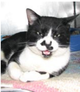
#257 Jonah-Sponsored (Domestic Short Hair-black and white)