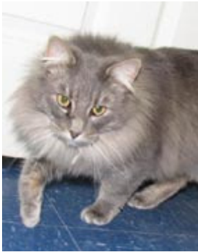
#2103 Joe-Sponsored (Domestic Long Hair-gray)