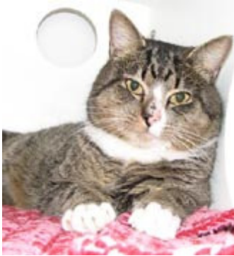
#271 Arnie-Sponsored (Tabby - Brown)

“Hi. My name is Arnie, and I have to apologize for my pictures. I'm was really afraid when I first arrived. A lady that lives over on Yorkshire Drive caught me in a trap, and that's enough to scare a kitty to death. Then she brought me out here and left me. I've come out of my shell quite a bit though and I'm very friendly now. I sure hope will come out here to get me and take me home cause I don't like this place at all.” Thank you to an anonymous donor, who sponsored a portion of Arnie's adoption fee. Now he can go home at a reduced rate!