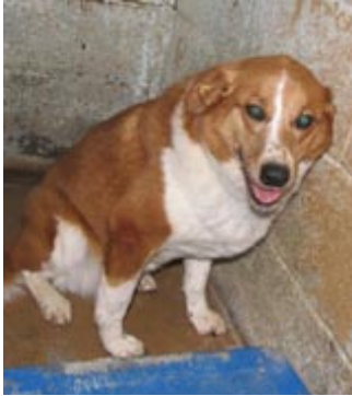
#31 Colby-Sponsored (Collie Mixed )