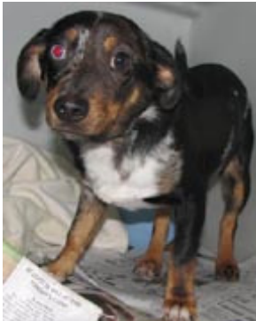
#24 Joey-Sponsored (Dachshund Mixed )