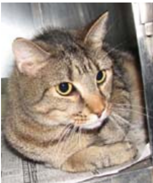
#253 Peanut-Declawed and Sponsored (Tabby – Brown)

"Hello. My name's Peanut, and I'm very pleased to meet you. Now, why are you laughing at me? Well, that's not very nice! Yes, I know I'm a little on the chubby side, but that's just means there's more love in me to give to my new family. I'm declawed in the front too, so I won't tear up your furniture!" Thank you to an anonymous donor, who sponsored a portion of Peanut's adoption fee. Now he can go home at a reduced rate!