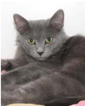
#211 Tess-Sponsored (Russian Blue)