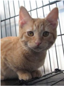
#2251 Squirrely-Sponsored (Domestic Short Hair-orange)