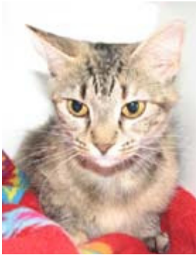
#221 Ava-Sponsored (Tabby – Grey)

"Hello there. My name is Ava and I'm a beautiful momma kitty out at the shelter. I came here from over on Scarlett Lane with my five babies, three boys and two girls. They're already weaned though, so we're all ready to be adopted. They're really cute so they'll probably get adopted quickly. I just hope I have as much luck." Thank you to an anonymous donor, who sponsored a portion of Ava's adoption fee. Now she can go home at a reduced rate!