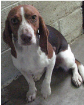
#39 Jada-Sponsored (Beagle)

"Hi there! My name is Jada and I'm a young beagle girl who came to the shelter from down on Hammonds Creek. I kept waiting for my owner to come out here to get me, but that was a few weeks ago and they haven't shown up yet. I wonder what's taking them so long. Do you think they just don't want me anymore? I sure hope SOMEBODY wants me, because I sure do want SOMEBODY. I think every pet deserves a home of their own, and as long as I've been here, I think its about time I get out of this kennel and meet my new family. Space is running out and all of us dogs want to get adopted soon." Thank you to an anonymous donor, who sponsored a portion of Jada's adoption fee. Now she can go home at a reduced rate!