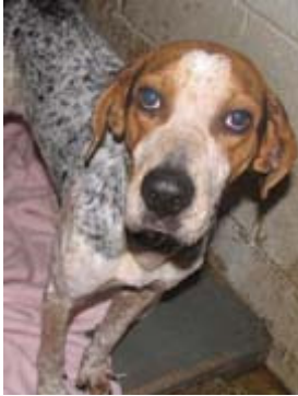
#121 Bud-Sponsored (Bluetick Coonhound)

'Hi! My name is Bud and I'm one of the many, many dogs that came in right at the end of the year. I don't know why there are so many of us here, and why we don't all have good homes, but the Humane Society says they're going to work hard to find a family for each and every one of us! I sure hope they're right cause I don't like the shelter much and I just want to go home.' Thank you to an anonymous donor, who sponsored a portion of Bud's adoption fee. Now he can go home at a reduced rate!