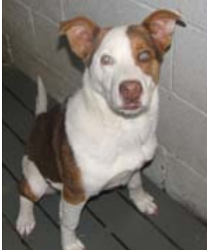
#129 Lyla-Sponsored (Shepherd Mixed)

'Hello! My name is Lyla and I'm a sweet mixed breed dog of some sort. I'm out at the animal shelter in Lawrenceburg. I was so happy when the picture lady came cause I thought she might have a few minutes to play with me. And she did! It was so much fun! I get a little scared sometimes though and cower down, so somebody might have hit me before. I'm a sweet girl who needs a new home.' Thank you to an anonymous donor, who sponsored a portion of Lyla's adoption fee. Now she can go home at a reduced rate!