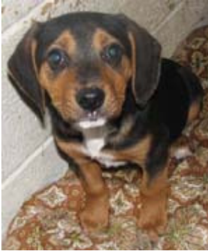
#130 Ty-Sponsored (Beagle, Rottweiler Mixed )

'Hi. I'm Ty and I'm an adorable little pup that they found wandering around down on Anderson City Road. I was there with my bubby, Vinnie. He's here too and we're both up for adoption because our owner never came out here to claim us and take us home. We're just a few weeks old and we need a new momma or daddy. Will you be the one?' Thank you to an anonymous donor, who sponsored a portion of Ty's adoption fee. Now he can go home at a reduced rate!