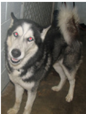
#161 Conan-Sponsored (Husky)