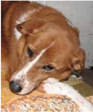
#187 Tilly-Sponsored (Collie Mixed)

'Hello. My name is Tilly and I'm a scared little girl out at the animal shelter in Lawrenceburg. I'm sweet as can be, but this place is frightening for a homeless dog like myself. I really like people, but when the girl was taking my pictures, the flashy thing kind of startled me and just wanted to go hide. Maybe I'll feel better in a few days and she can try to take some better pictures.' Thank you to an anonymous donor, who sponsored a portion of Tilly's adoption fee. Now she can go home at a reduced rate!