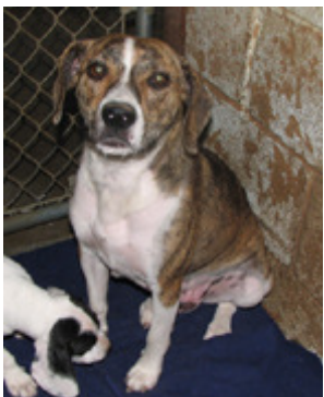
#311 Lucy-Sponsored (Labrador Retriever Mix)

'Hi. My name is Lucy and I'm some sort of mixed breed dog who came to the shelter with my little boy, Cole, from down on Corinth Road. He's only about eight weeks old and it wasn't safe for us to be out running around. There's another little pup here who I've adopted cause he doesn't have a momma. But we'll all three be going up for adoption real soon.' Thank you to an anonymous donor who sponsored a portion of Lucy's adoption fee. Now she can go home at a reduced rate!