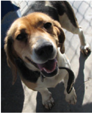
#270 Nicki-Sponsored (Beagle)