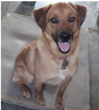
#1151 Darby-Sponsored (Labrador Retriever Mixed )

'Hi. My name is Darby and I'm a sweet, sometimes shy mixed breed dog who originally came to the shelter before I was even born. My momma was pregnant when they found her, and after she weaned us, we all got adopted. But the person who adopted me isn't able to keep me, so they had to bring me back here. So now I'm looking for a new family who might give me a second chance.' Thank you to an anonymous donor, who sponsored a portion of Darby's adoption fee. Now she can go home at a reduced rate!