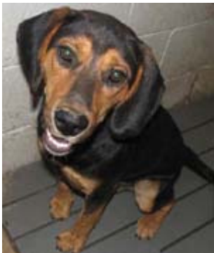
#425 Buck-Sponsored (Beagle Mixed )