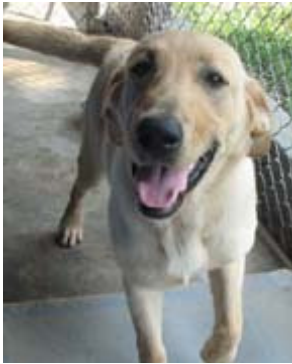
#423 Moe-Sponsored (Yellow Lab)