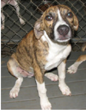
#448 Cole-Sponsored (Labrador Retriever Mixed )