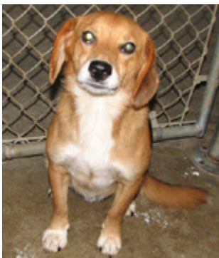
#458 Lance-Sponsored (Beagle Mixed )

'Hello. I'm Lance and I'm a sweet, gentle little beagle mix boy who came to the shelter from down on Tracy Road. There have been lots of dogs coming in from there lately, so I think our owners must be dumping us there. That's what people around here do when they don't want their dogs anymore. I think its mean, but its just a reality for us homeless dogs.' Thank you to an anonymous donor, who sponsored a portion of Lance's adoption fee. Now he can go home at a reduced rate!