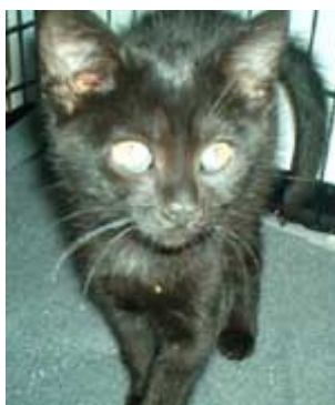
#206 Flop-GloMarr (Domestic Short Hair-black)