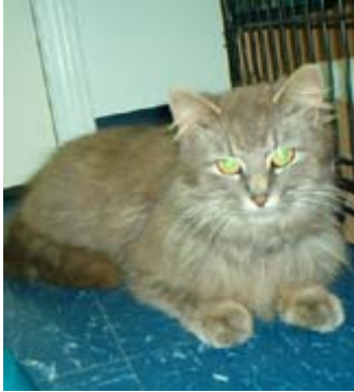
#108 Maggie-Sponsored (Domestic Long Hair-gray)