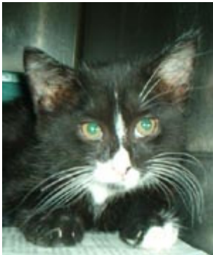
#230 Precious-Glomarr (Domestic Medium Hair-black and white)

'Hi. My name is Precious, and I'm one of a group of four kittens turned in by our owner. He said he tried to find homes for us, but just couldn't. Why in the world don't people just have their cats fixed so that little guys like us don't end up at the shelter? Well, we're up for adoption and there's no better time to adopt than right now!” UPDATE: PRECIOUS CAN NOW BE SEEN AT THE HUMANE SOCIETY'S KENNEL SPACE AT GLO-MARR PET STORE, LOCATED ON LINCOLN STREET.