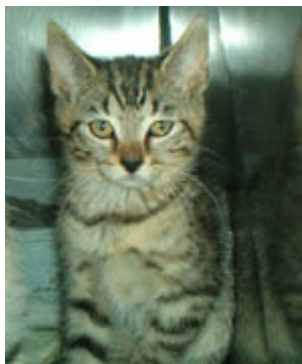
#207 Starr-GloMarr (Tabby – Grey)

'Hi. My name is Starr and I'm here with my bubby and sissy. We're at the shelter waiting for people to come adopt us. We're only about nine weeks old and are soooo cute! Don't you agree? Well, what are you waiting for then? Come on out and see which one of us you want to take home!' UPDATE: STARR CAN NOW BE SEEN AT THE HUMANE SOCIETY'S KENNEL SPACE AT GLO-MARR PET STORE, LOCATED ON LINCOLN STREET.