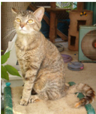
#271 Kali-Sponsored (Tabby)