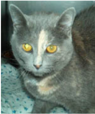
#241 Pumpkin (Dilute Calico)

"Hi. My name is Pumpkin and I was an owner turn-in. Me and my sister both, actually. But she got adopted already. So now I'm here, waiting for my turn. I'm a very sweet kitty with the prettiest eyes. I'm housebroken and I've been declawed in the front too. I hope you'll come adopt me so I won't have to spend the holidays in a cage..."