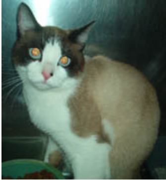
#203 Peanut-Sponsored Siamese Mix

"I gotta be honest with you. I don't really like it here. I was brought here after hanging around Vowels Court for a while. They were afraid I might get hit by a car so I came here so that they can find me a safe indoor home. I'm only about a year old and they say I look like I might be part siamese." Thank you to an anonymous donor, who sponsored a portion of Peanut's adoption fee. Now he can go home at a reduced rate!