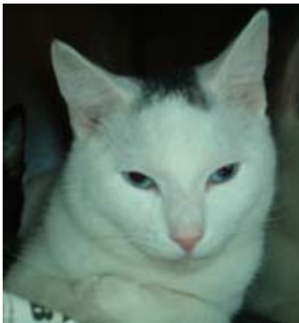
#216 Gizmo Domestic Short Hair - gray and white

"Don't I have the most beautiful blue eyes? I mean, they're gorgeous! I just can't say enough about them. I'm a real sweet kitty and I had a home of my own once, but my owner was moving so she had to bring me and my sister, Socks, out here so they could find us new homes. Please contact the shelter if you're interested in adopting one of us"