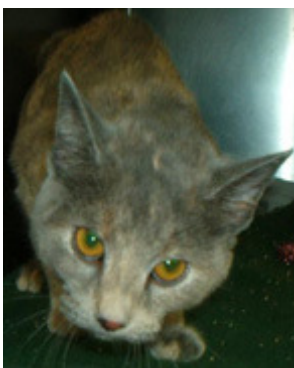
#270 Sabrina-Sponsored (Domestic Short Hair)