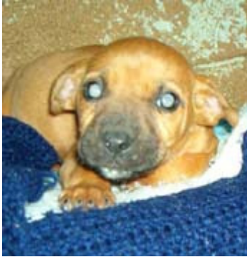
#225 Mia-Sponsored (Boxer Mix)

"Hi. My name is Mia, and Mack and I were brought to the shelter after a lady down on Main Street found us on her front porch in the early morning hours. We didn't live there, so I guess somebody dropped us. So we came here instead, and they're gonna find us homes where our owners will love us for the rest of our lives." Thank you to an anonymous donor, who sponsored a portion of Mia's adoption fee. Now she can go home at a reduced rate!