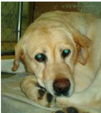
#230 Austin (Yellow Labrador Retriever)

"Hello. My name is Austin, and I'm a sweet sweet boy who came to the shelter just a couple of days ago, from over on David Street. I look to be full-blooded so hopefully if I don't get adopted, somebody else out there will love me and take me home with them. If you're interested, you can go ahead and fill out an application just in case."