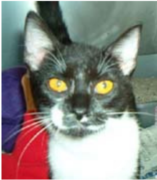
#281 Lacey-Sponsored (Domestic Short Hair-black and white)